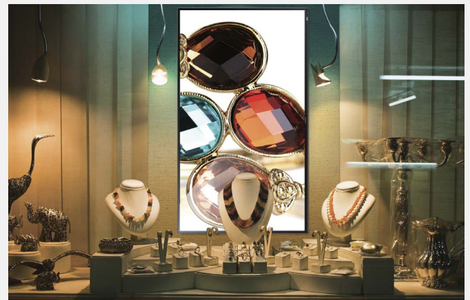
Figure 1. Commercial applications can leverage QMD Series clarity and operational capabilities.

Samsung QMD Series SMART Signage features a new design and delivers 3,840 x 2,160 resolution, multi-format PIP support, DP 1.2 support, set-back box (SBB) support, portrait or landscape orientation and reliable 16/7 operation for amazing flexibility and picture clarity in commercial settings. For example, retail stores can leverage Samsung QMD Series with UHD to improve their brand image and showcase products in sharp detail, while corporations and arena or museum security centers can use the high-resolution displays to enhance security with stable and vivid content playback.